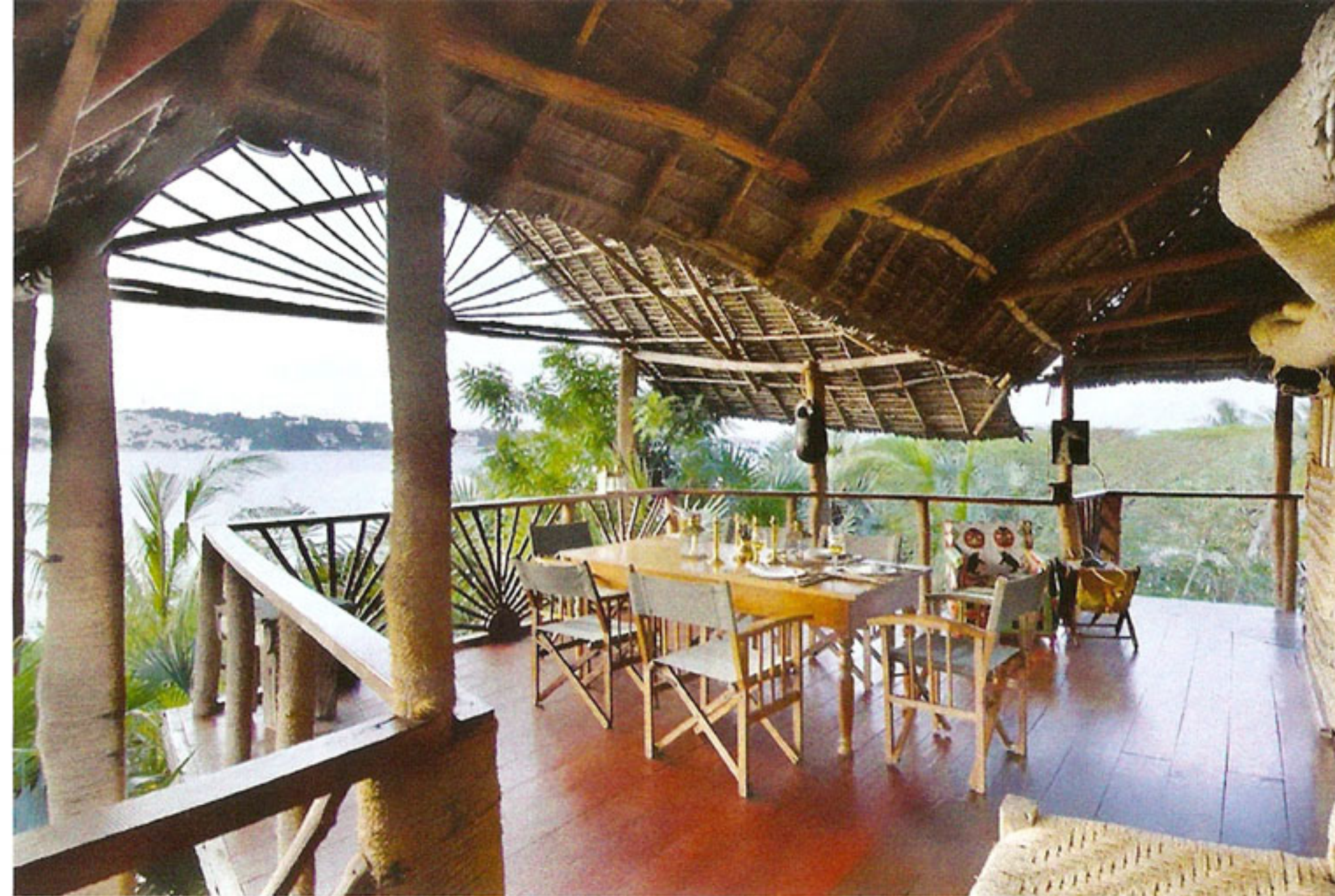
Above: view from the restaurant at Majlis hotel, Lamu. Below: Paul Klee’s Fire in the Evening , 1929, at the Museum of Modern Art, New York.

Moma’s collection also runs to several works by Julian Schnabel, a less surprising revelation than the fact that the new Majlis hotel ( www.themajlisresorts.com ; doubles from €480 full board) on Manda Island in Kenya’s LAMU archipelago does too. In the dining room of the 25-room beach hotel hang a couple of Schnabels, as well as a gilded elephant head by Armando Tanzini. To reach Lamu, you’ll probably need to overnight in NAIROBI , in which case the refurbished Giraffe Manor ( www.giraffemanor.com ; doubles from $645) makes a practical stopover. Just 30km from the airport, this former Scottish-baronial hunting lodge has been acquired by the Carr-Hartley family, who also own Sala’s Camp in the Masai Mara. There is a safari element here too, as eight rare Rothschild giraffes roam the grounds. ♦